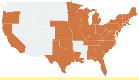
States with Reported Jumping Worm Presence.

Although jumping worms (AKA: Alabama Jumpers, Crazy Worms and Snake Worms) were imported from Asia almost 2 decades ago and are present in more than 30 states, today, controversy continues to stir in Minnesota over concerns that urban infestations will spread and endanger our northern forests. Presently, we do not know how close or even likely such an occurrence may be, but what we do know is